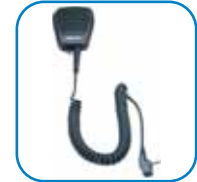
Heavy Duty Speaker Mic w/ Audio Earphone Jack (ACC-727)