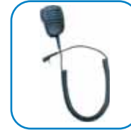
Heavy Duty Speaker w/ Locking Connector & Audio Earphone Jack (ACC-714)