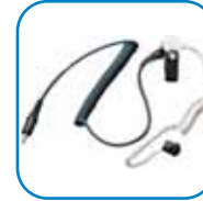
Coil-Cord Earphone, used w/ ACC-727 (QPA-1424)