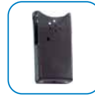
Leather Case w/ Belt Clip (ACC-302)