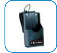
Leather Case w/ Swivel (ACC-304A)