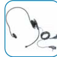
Ultra-lite headset w/ locking connector (ACC-616)