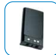
1200 mAh NiMH Battery (ACC-207)