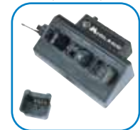
6 Station Gang Charger (ACC-460) Charger Cup Required (ACC-465)