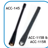
UHF Antenna 6", 450 - 490 MHz, SMA (ACC-145) & VHF Antenna 6", 148-162 MHz & 162-174 (ACC-115B & ACC-115R)