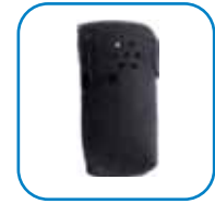
Nylon Case w/o Belt Clip (ACC-303)