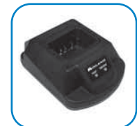
Single Unit Standard Charger Power Supply Included (ACC-480)