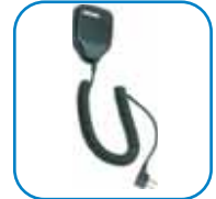
Speaker Mic w/ Angled Connector (QPA-1421)