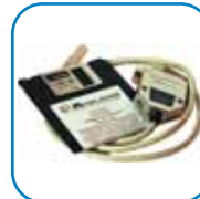
PC Programming Kit: Software & Cable Windows® 95 or Later (81-100)