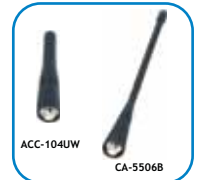
UHF Antenna 6" Stud Mount (CA-5506B) UHF Antenna 440-470 MHz (ACC-104UW)