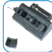
6 Station Gang Charger (ACC-460) Charger Cup Required (ACC-464)