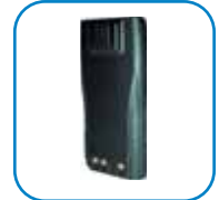
Battery Pack 1300 mAh NiMH Battery (18-B02)