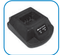
Single Unit 'Smart' Charger Base (ACC-470)