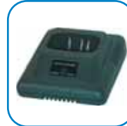
Single Unit Rapid Rate Desktop Charger (81-390) [Includes Power Supply]