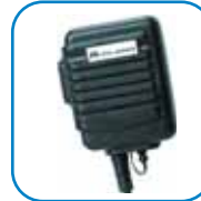
Weatherproof Speaker Mic (70-M45WP)