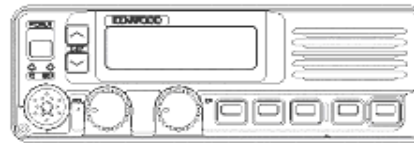
Basic Control Head (KCH-10)